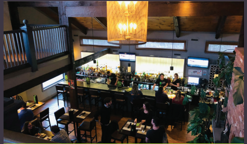
Balcony & Karaoke Room Combo

The Karaoke Room is our largest private room, located upstairs to the left of our middle room. In the summer months, the Karaoke Room has a small private deck with slider doors. As its name implies, the Karaoke Room provides guests access to our karaoke system, if so inclined.