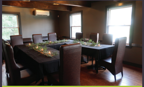
The Window Room

This is our smallest private room, perfect for meetings or small gatherings. This room has access to a private monitor. The Middle Room is located upstairs, in between the Karaoke Room and the Window Room.