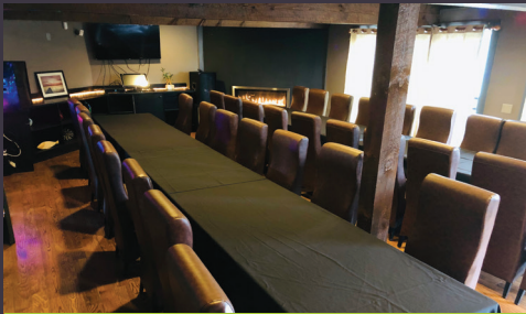
The Karaoke Room

The Window Room is a perfect room for intimate meetings or gatherings. This room has access to a private monitor. The Window Room is located upstairs, to the right of our Middle Room, with windows overlooking our front lawn and Main Street.