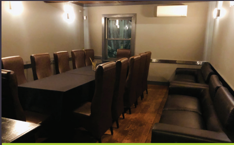
The Middle Room